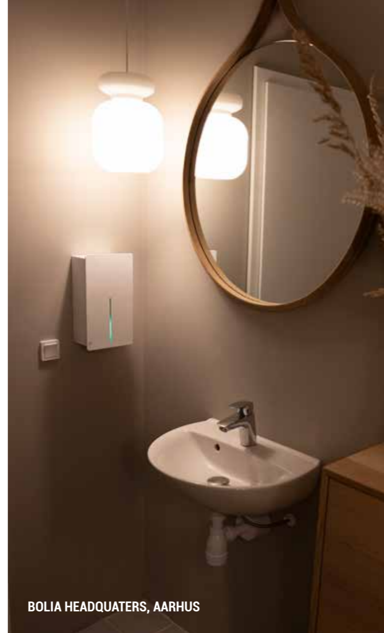
BOLIA HEADQUATERS, AARHUS