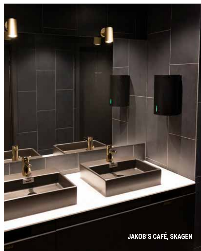
JAKOB'S CAFÉ, SKAGEN