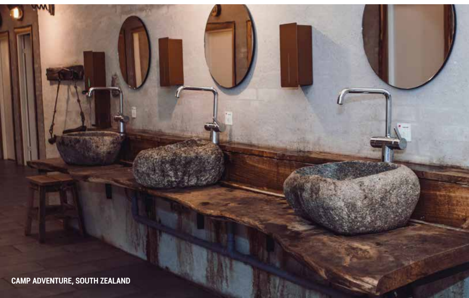
CAMP ADVENTURE, SOUTH ZEALAND