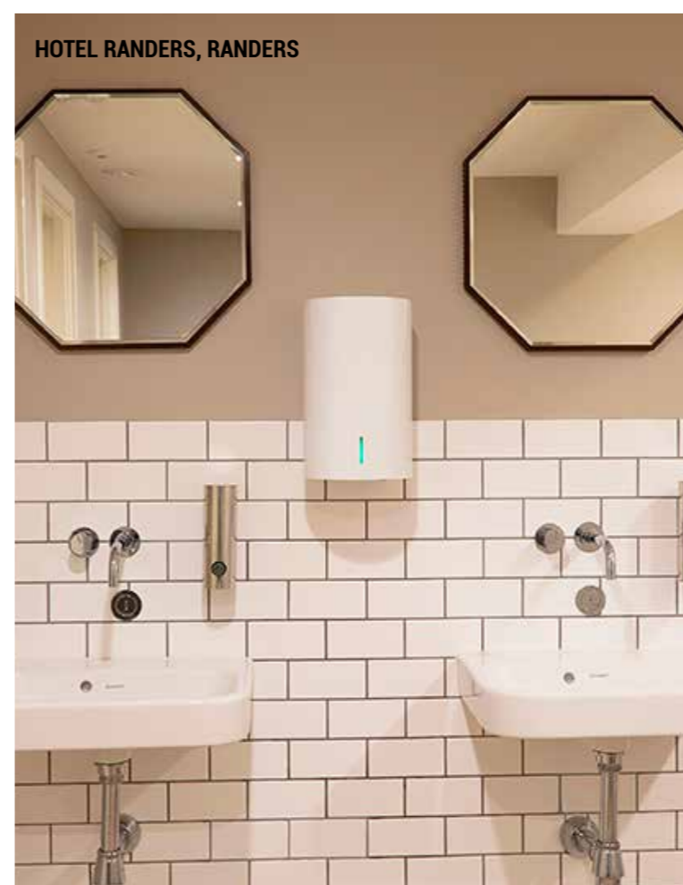
HOTEL RANDERS, RANDERS